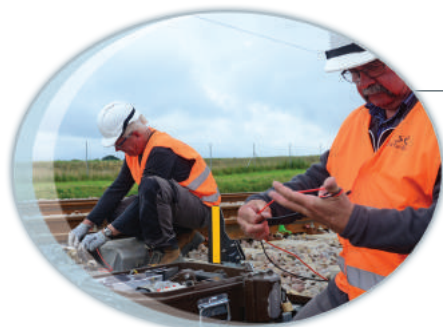
A network of training experts

Validation platform for PIPC interlocking and MISTRAL (ATS) platform