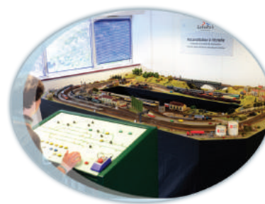
Railway model with relay-interlocking demonstrator and trackside / wayside equipment