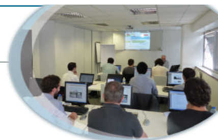
Dedicated and equipped training room for up to 15 people